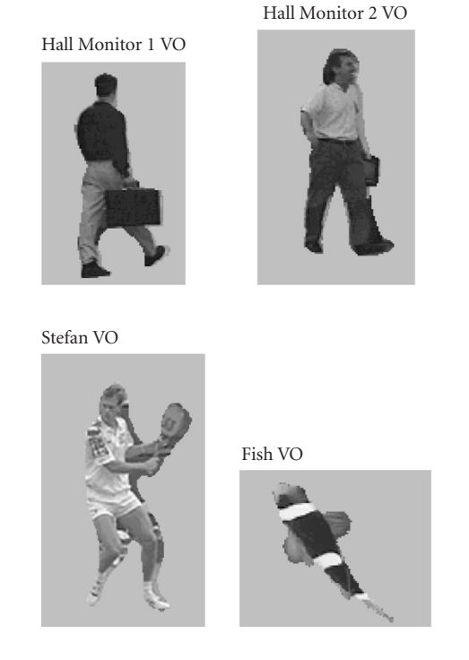
FIGURE 3: The video objects classified as being similar in terms of their local motion to the query video object Hall Monitor 1.

TABLE 1: Local motion retrieval results for the News 1 video object